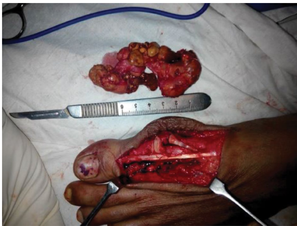
Figure 2: Intraoperative picture showing the origin from tendon sheath of extensor digitorum brevis and capsule of first metatarsophalangeal joint.