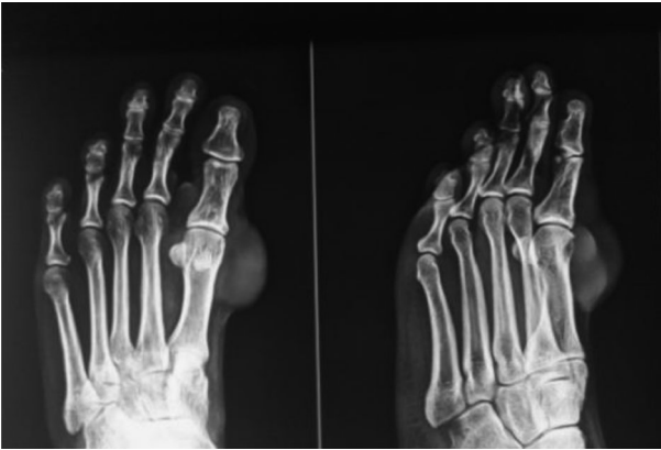
Figure 1: Perioperative X-ray film showing the soft tissue density overlying the first metatarsophalangeal joint.